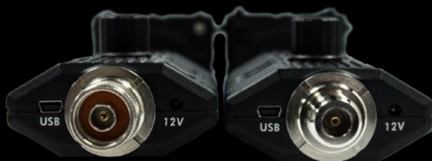
RF Connectors N Male and N Female