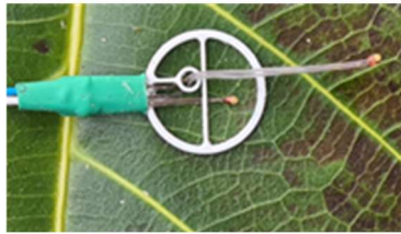
LAT-B3: Magnet-mounted for normal for leaf (<0.7 mm thick)