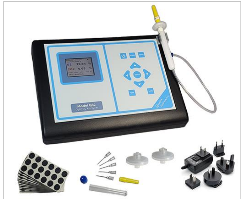
Please see last page for photo of menu screen