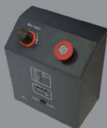
Automatic Centering Controller