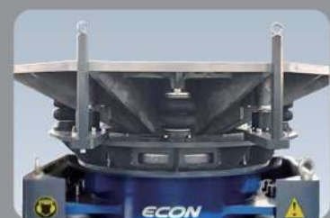
Auxiliary Stay Bearing