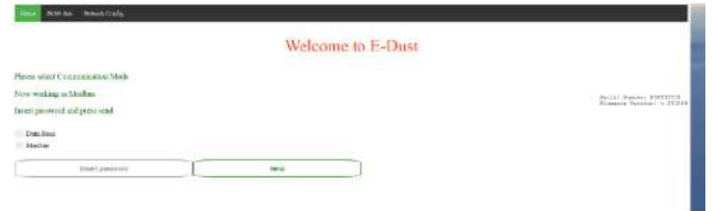
Figure 9: E-Dust platform welcome screen.

6. Next, network parameters must be configured. To do this click on the tab “network config” and the screen shown in figure 9 will open.