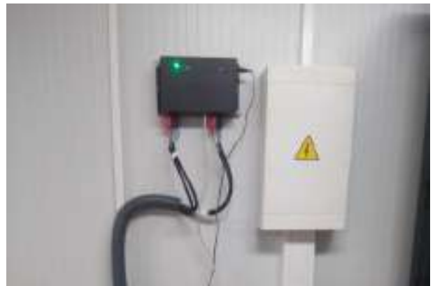
Figure 5: An example of an E-Dust attachment via screws to the wall of a control room at a PV plant.