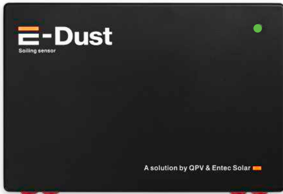
Figure 1: Frontal view, with the team logo and the LED in the upper right corner.