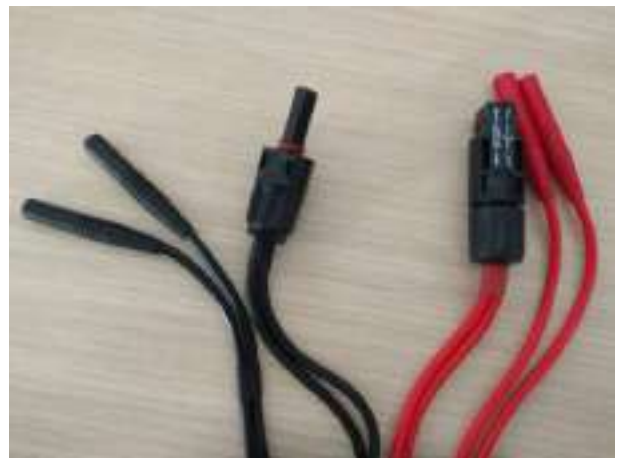
Figure 6: An example of a (positive and negative) cable set for the four-point probe measurement. At one end, both cables connect to the MC-4 connector and at the other end each cable connects to an isolated male banana connector.