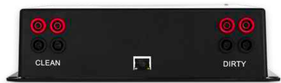
Figure 3: Front peripherals, including: four banana socket connectors for the clean module, four others for the dirty module, and an RJ-45 connector for an Ethernet connection. The red connectors are for the positive pole and the black connectors for the negative pole.

1 VERY IMPORTANT: maximum allowed voltage! On cold days this value can exceed the catalog value. Check the E-Dust maximum recommended voltage.