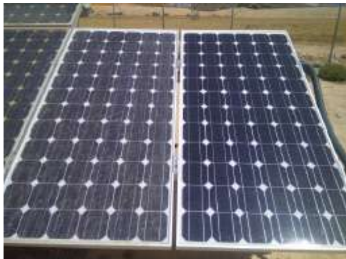
Figure 4: An example of two installed modules, one as a dirty reference module and the other as a clean reference module.

12. If you cannot confirm points 10 and 11, contact QPV staff for technical assistance.