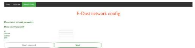
Figure 10: E-Dust network configuration screen.

10. IMPORTANT: do not forget to reset your computer network settings to the original values.