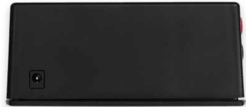
Figure 2: Reset button (left) and power connector (right). These are located on the left and right sides of the device, respectively.