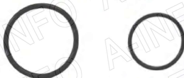
Material: Conductive Silicone Rubber