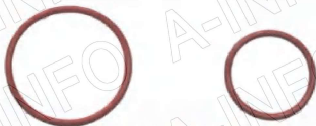
Material: Silicone Rubber