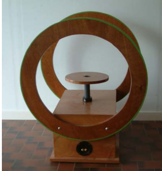
Andamento Induzione Magnetica (B)