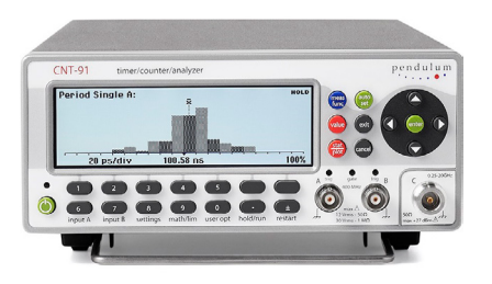
Figure 6: The same result as in Figure 5, now displayed as a histogram.