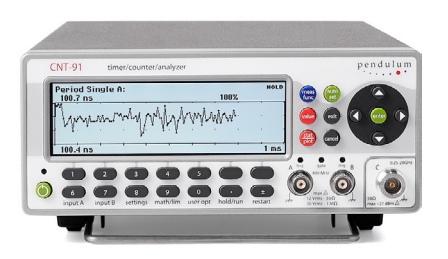
Figure 5: Display showing the trend (signal over time) of sampled data.