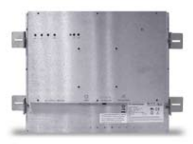
Mounting L-brackets (standard)