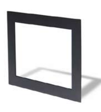
Optional Industrial Flange Bezel (Part Number: 5021104)