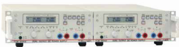
19" adapter, TOE 9522 2 HU, parallel installation set for 2 units of the TOE 8950 series