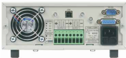
Rear of unit Dual-output power supply with USB interface TOE 8952 series