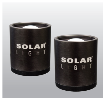
Included NIST-Traceable UV & UVA Sensors