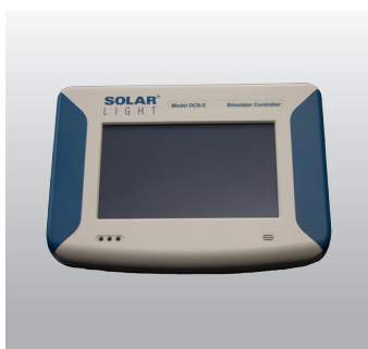
Included DCS-2 Automatic Dose Controller

SL/SPFTestingMultiport/601v2.5_08/2017 Specifications subject to change without notice. *U.S. Pat. 7,657,147