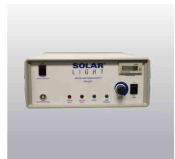
Included XPS-300 Xenon Lamp Power Supply

100 East Glenside Avenue • Glenside, PA 19038 • USA • P 1 215 517 8700 • F 1 215 517 8747