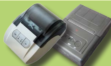
Mirco Printers for HARTIP3000/HARTIP2000

Mirco-printer Impact device D Impact device DC Impact device D+15 Impact device G Impact device C Impact device E Impact device DL Impact body D/DC Impact body D+15 Impact body G Impact body C Impact body E Impact body DL Test block G / D with certificate Test block D w/o certificate Special support rings Leather case Interface cable (to PC) Data management software