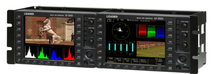
Two LV5333s on a Rackmount (LR-2752)