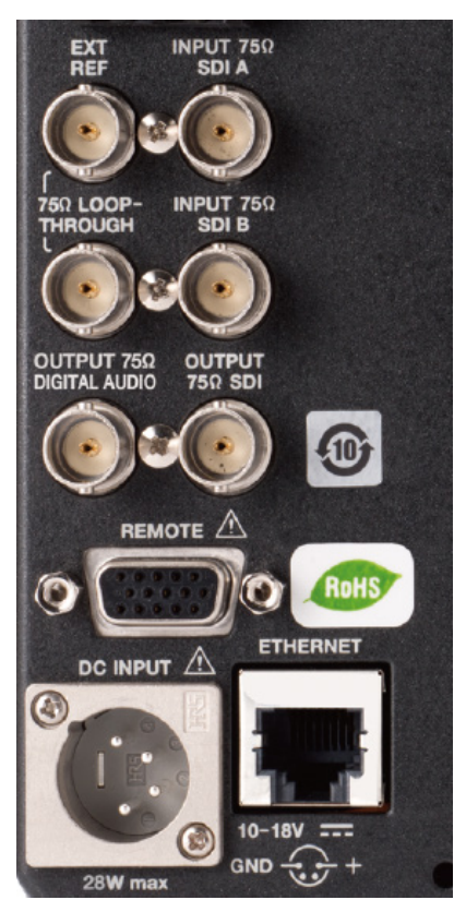
LV5333 Partial View of the Rear Panel