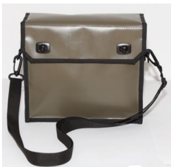
Soft carrying case