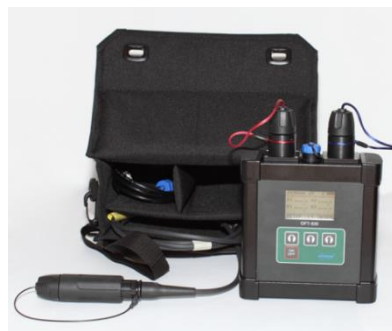
Complete test set, including: OFT-920 tester, power charging adaptor, soft carrying case, USB Cable, reference patchcord 4

Note: 4) reference patchcord – would be ordered according to STR_03-10_EN-HMA_Master