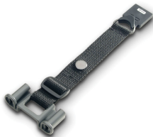
U1171A Magnetic Hanging Kit

For fastening of DMM to a steel surface so both hands are free.