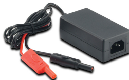
U1170A AC Adaptor