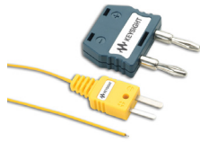
U1186A K-type Thermocouple and Adapter