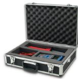
U1172A Transit Case (Aluminium-clad)