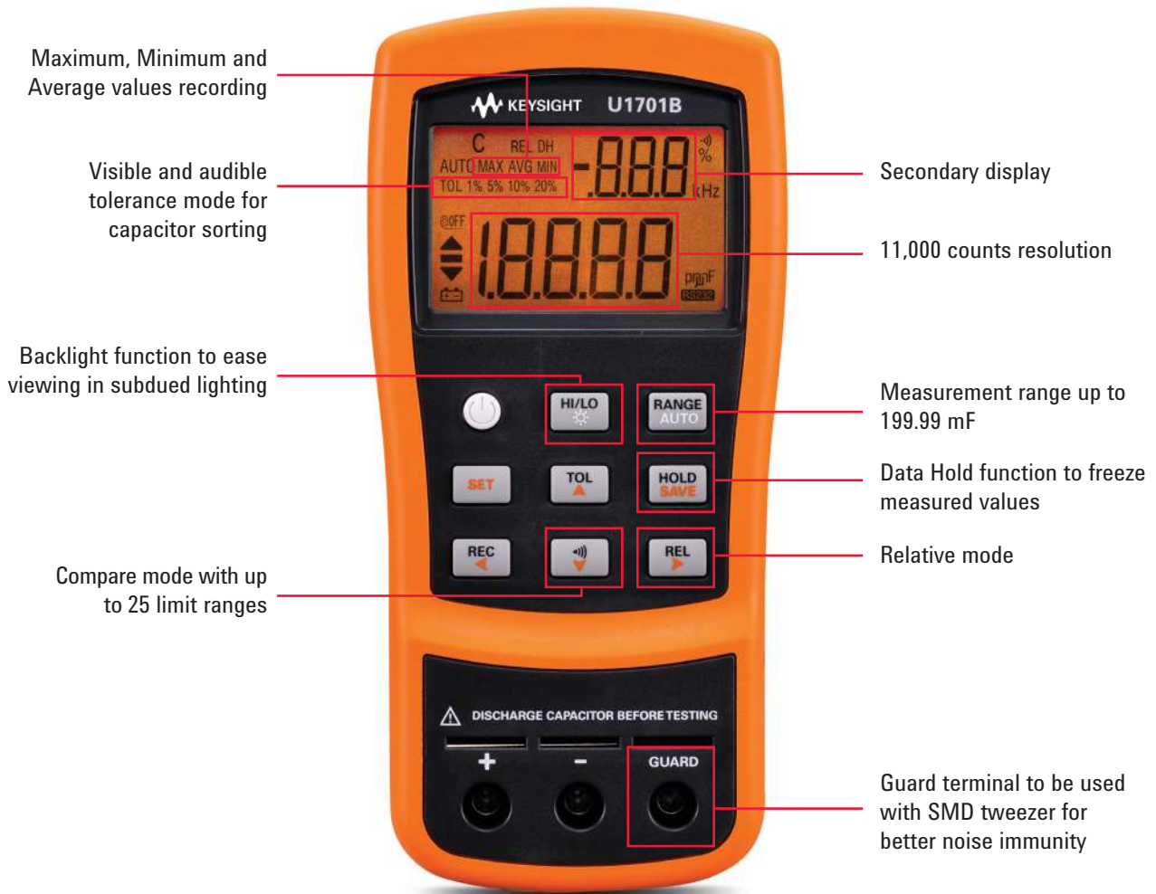
Figure 2. U1701B front view