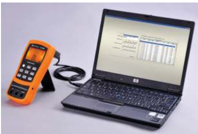
Figure 1. Automate the recording of continuous readings when you hook the U1701B to a PC