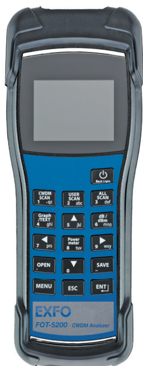
Front view of the FOT-5200