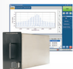
Optical Spectrum Analyzer FTB-5240S