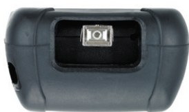
Top-side view of the FOT-5200