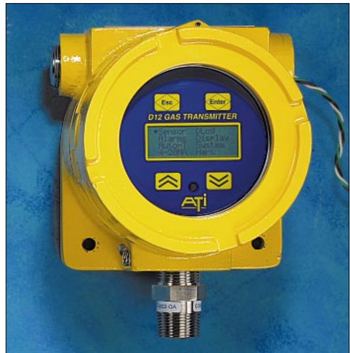
D12-IR Gas Transmitter

For plants operating with HART™ protocol communications systems, the D12-IR can be supplied with this option. Our HART™ output supports both 4-20 mA and constant current mode of operation.