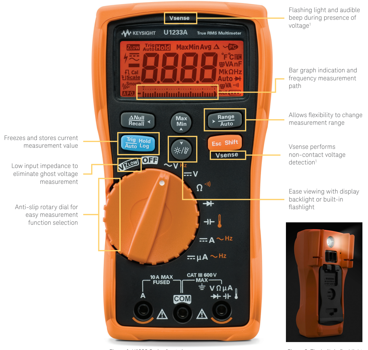
Figure 1. U1230 Series front view

Figure 2. The built-in flashlight as illustrated