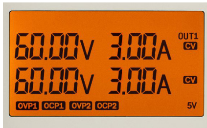
Figure 2. Backlight on/off feature with dual reading (voltage and current) on an LCD display