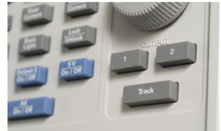
Figure 3. Simplifies Output 1 and Output 2 setup with tracking feature