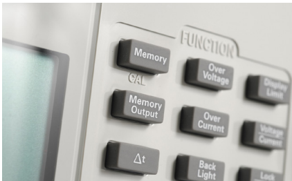
Figure 1. Output sequencing made easy with intuitive keypads

Both models of the U8030 series come with a set of features to suit your needs while remaining easy to use. The LCD screen displays both voltage and current readings in a one-view panel while the all ON/OFF button allows multiple outputs to be controlled simultaneously. Additionally, the auto-track feature simplifies setup between output 1 and output 2. With these, you get a solid bench power supply plus a set of convenient and easy to use features.