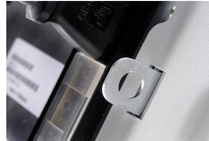
Physical lock mechanism as illustrated

Essential security features: Over-voltage protection (OVP)/ Over-current protection (OCP), keypad lock and physical lock mechanism