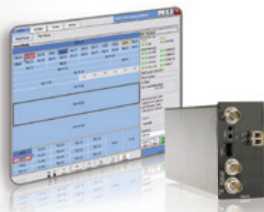
SONET/SDH Test Modules FTB-8115 – FTB-8120 FTB-8130 – FTB-8140