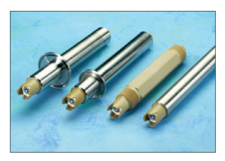
Sensor Mounting Configurations