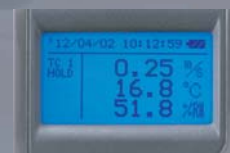
LCD display with bright backlight