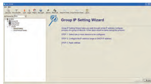
Monitoring and Configuration interface