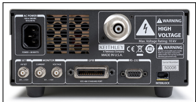
Model 2290-10 rear panel showing the IEEE-488 interface connector, RS-232 interface connector, high voltage output connector, analog control/output connectors, and interlock connector.