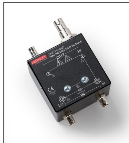
The Model 2290-PM-200 Protection Module protects low voltage measurement equipment from voltages greater than 200V.

When low voltage measurement instrumentation is used in the high voltage circuit, the protection module safely clamps the voltage across the instrument to a maximum value of 200V even when a device under test (DUT) breaks down. Thus, a Series 2290 Power Supply, Model 2290-PM-200 Protection Module, and Keithley accessories provide all the elements for building a safe, high voltage test environment.