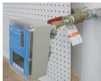
Mounted directly on quick connect outlet