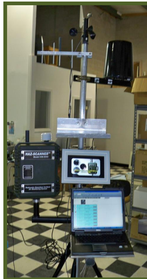
Model: HIM-6000 Shown with optional tripod stand and rain gage