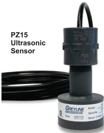
PZ15 Ultrasonic Sensor

Access to the UF OC5000 calibration menu and settings are password-protected when enabled.