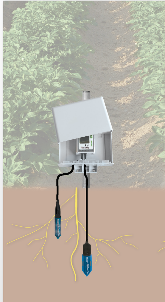
WatchDog 1000 Series Micro Station shown with one WaterScout SM 100 Sensor and one SMEC 300 sensor.

You can collect data and log results when the WaterScout SMEC 300 Sensor is connected to a WatchDog Station.