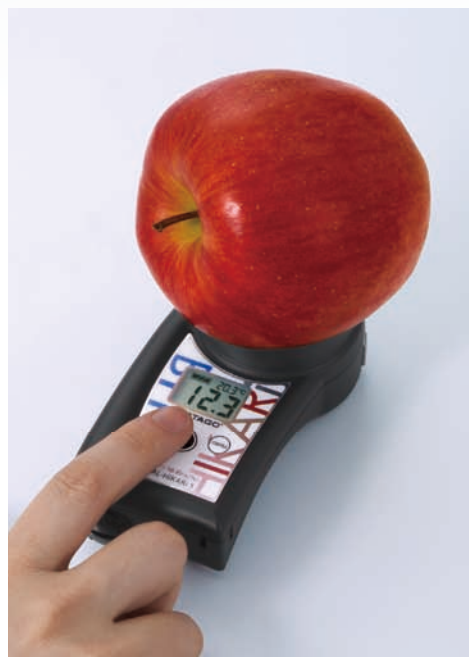
Place an apple, then press the START button