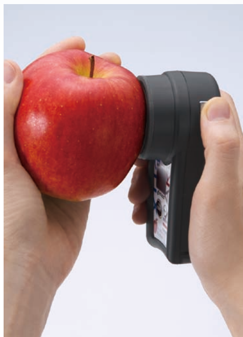
Press against an apple, then press the side button