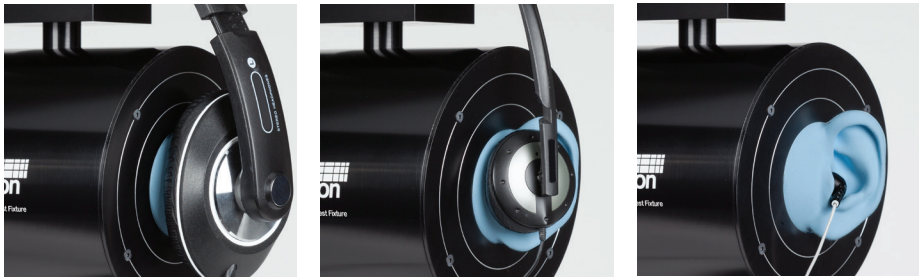
AECM206 shown testing circum-aural and supra-aural headphones, and intra-concha earbuds.