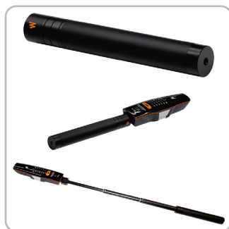
WaveStick Part # WWMA0002

Adjustable extension stick (73 cm / 28,74 ")