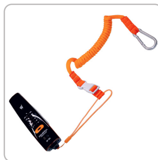
Safety cable Part # WWMA0001

Adjustable extension stick (73 cm / 28,74 ")