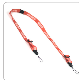
WaveMon Lanyard Part # WWMA0003