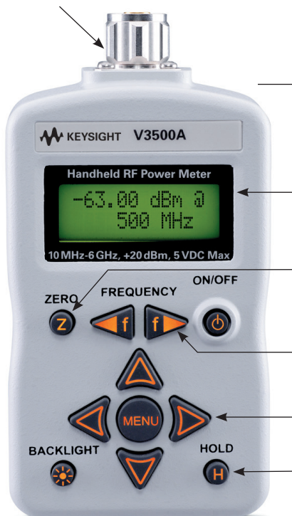
Figure 1. Signal connection

While holding the body of the power meter in one hand, turn the Type N male connector nut to tighten the connection (do not turn the body of the V3500A). Continue to do so until the connection is hand-tight. It is important to turn the nut of the connector rather than the body of the power meter when tightening the connection.