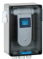
Industrial Enclosure HH ENC