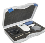
Carry Case Small AS R40