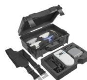
Carry Case Large AS R41