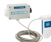
IP4 Remote Sensor Kit AS R13