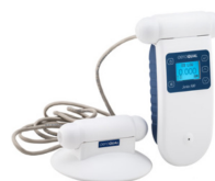
Remote Sensor Kit AS R10