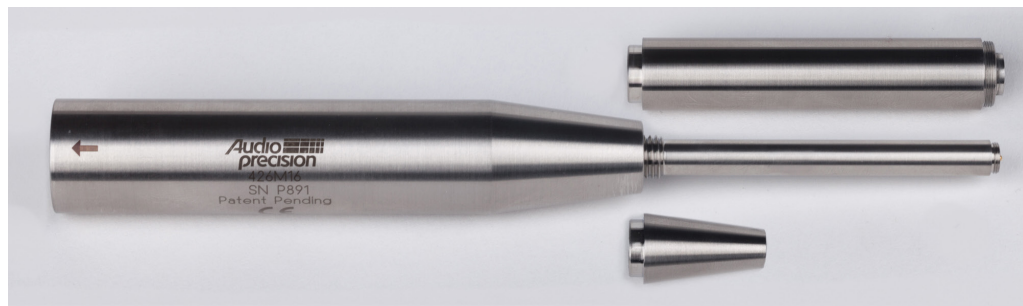
426M16 preamplifier components, which can be assembled for use with either 1/2" or 1/4" mic cartridges.

With the 376M03 microphone system, we are introducing the 426M16: a flexible, phantom-powered preamplifier that can mount either 1/2" or 1/4" standard IEC 61094-4 prepolarized microphone cartridges.