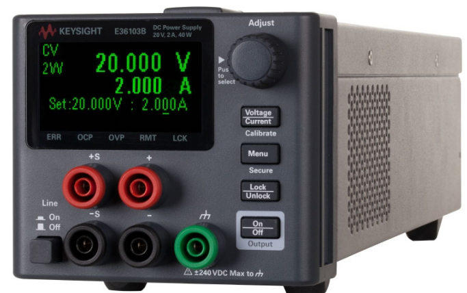
Option J01 recessed binding posts