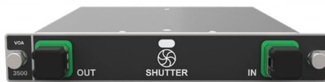
Figure 1. With or without the power monitoring option, the FTBx-3500 module occupies just a single slot.

The attenuating filter technology used in the FTBx-3500 makes it ideal for multimode BER and transceiver testing.