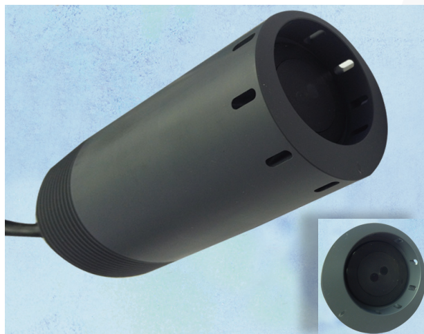
Submersible Turbidity Sensor

Extra Outputs/Relays. Expansion board to add a third 4-20 mA analog output or to add three additional non-isolated low power relays.