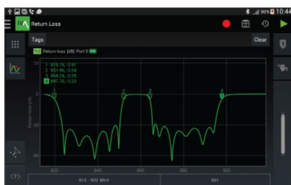
Return Loss Trace