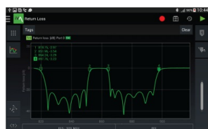
Return Loss Trace