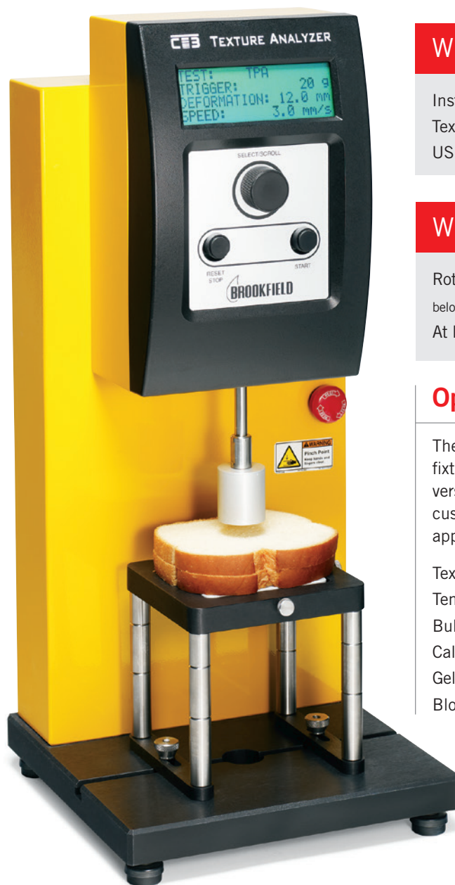
CT3 with Fixture Base Table and Cylindrical Probe in compression (TPA) mode

allows for larger samples and more accessory choices